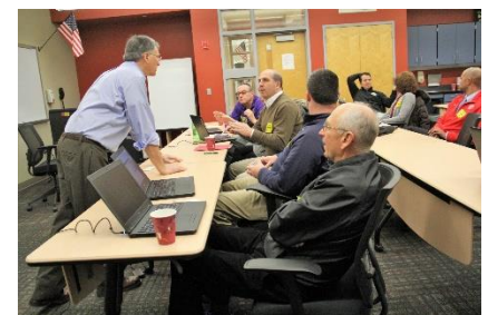
rSchool Today training at North Kingstown High School

The league began its initial training sessions for using rSchool Today on January 24, 25, and 26. The training focused on setting up each schools' "landing page" and scheduling using the new website. The next round of training will take place sometime in March.